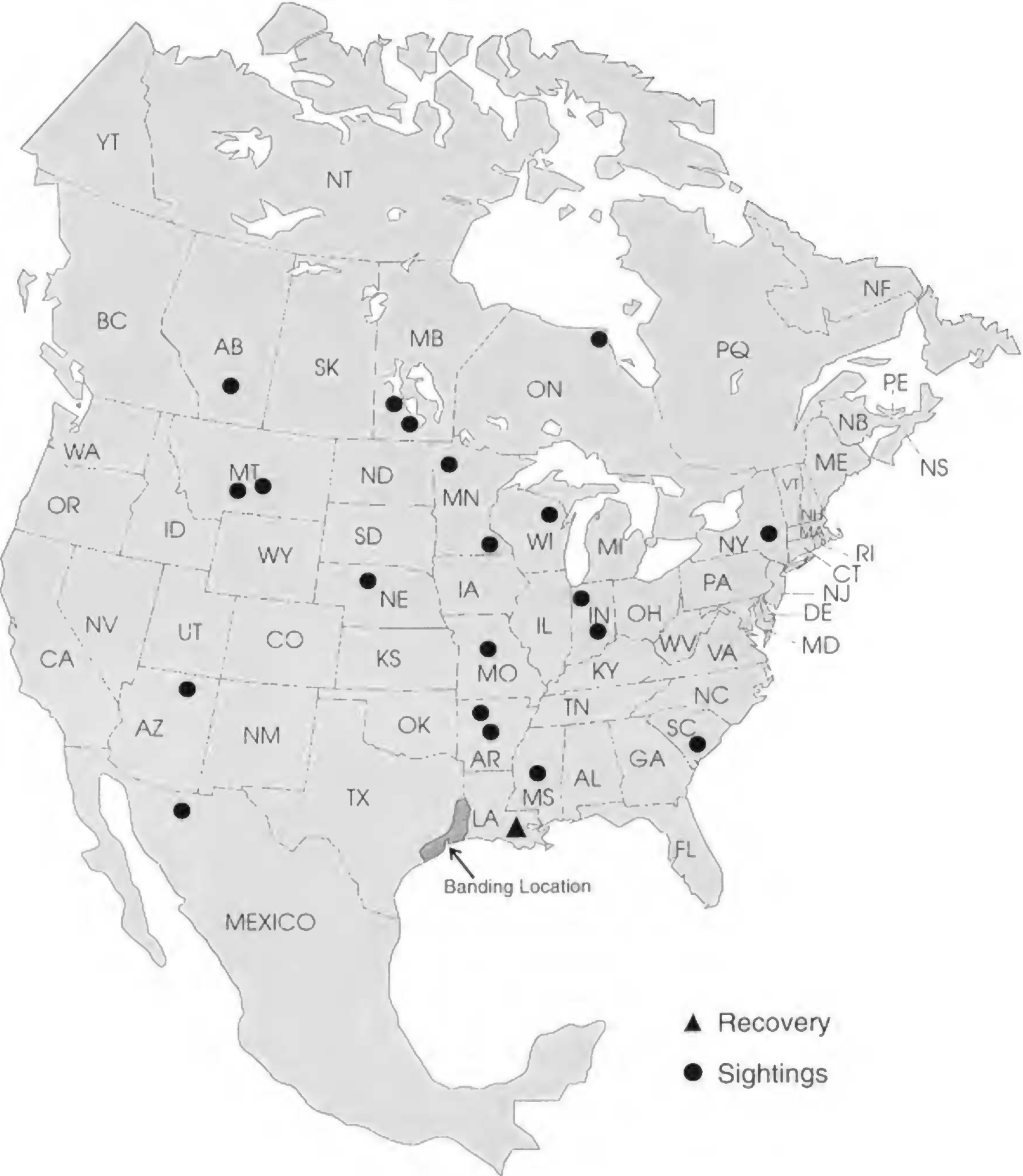
Figure 2. Location of out-of-state sightings and recoveries of bald eagles banded and color-marked as nestlings in Texas, 1985-93.